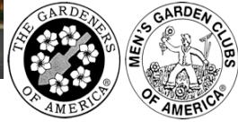
Ramada Plaza Hotel and Conference Center – Location for 2018 TGOA/MCGA National Convention. Ft. Wayne, IN